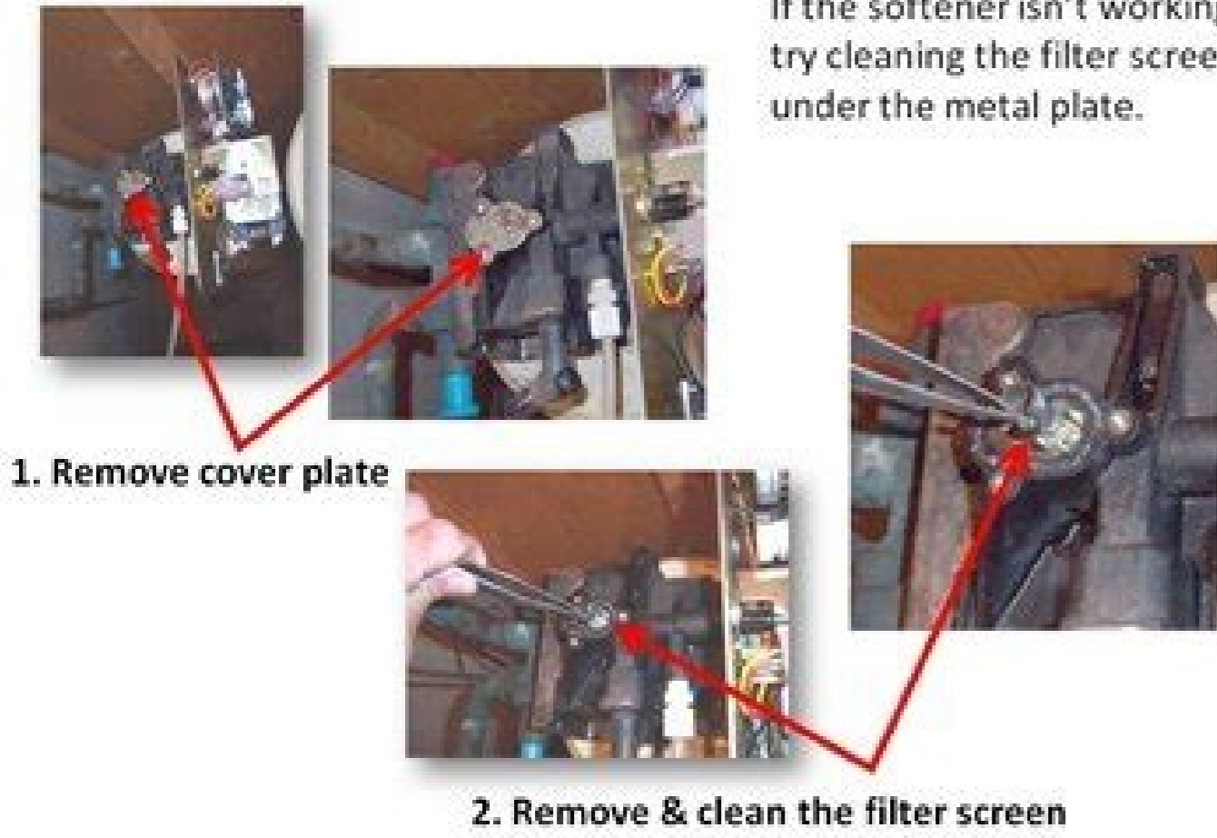
1. Remove cover plate

If the softener isn't working, try cleaning the filter screen under the metal plate.